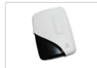
ODS with E-Port