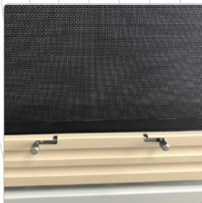
Spring Assist *4500mm max width