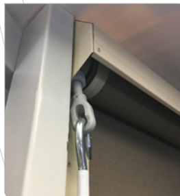
Gearbox - Crank operated *5000mm max width