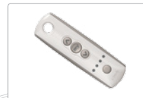
SOMFY 240V RTS with Transmitter